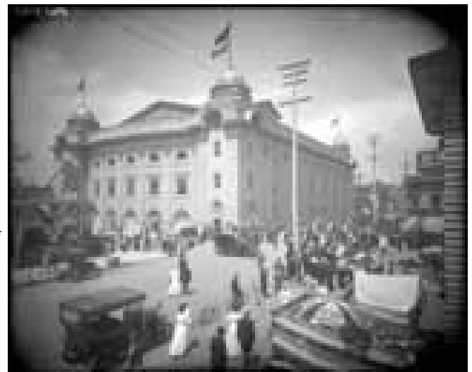
1908 Democratic National Convention