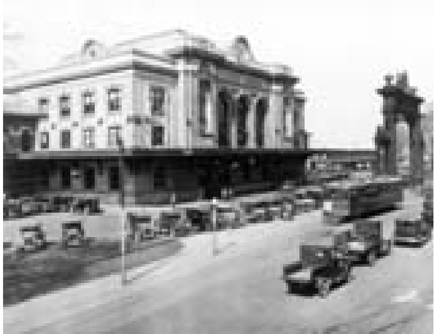
Denver Union Station circa 1910